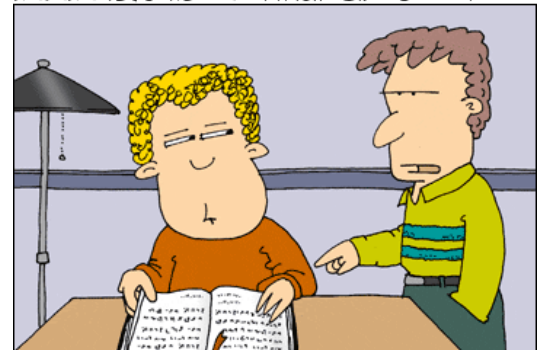
IT'S NOT FINE-PRINT, THEY'RE FOOTNOTES